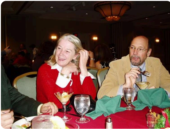
2008 ATCO Holiday Party at Marriott