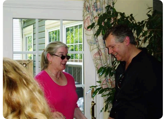
2005 ATPCO picnic at Ann's