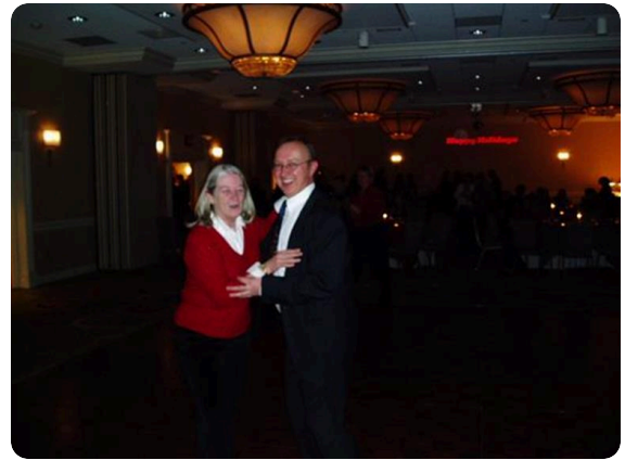
2008 ATCO Holiday Party at Marriott